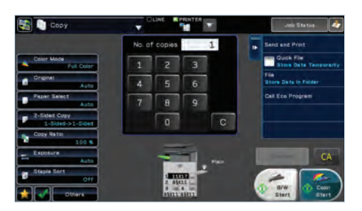
Intuitive copy screen shows options on the left and menu guidance on the right.