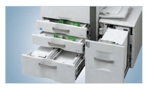
Available paper capacity stores up to 6,600 sheets.