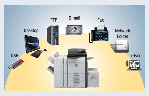
Sharp's integrated network scanning offers one-touch document distribution to multiple destinations.