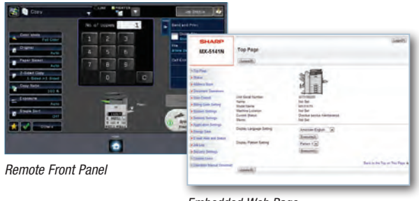
Embedded Web Page

Managing all of the advanced features of your Sharp product is simple and easy. Ask your Authorized Sharp Dealer about the My Sharp website. This dedicated customer training website is customized to your MX-4140N/4141N/5140N/5141N and allows you to locate resources and find information specific to your configuration, truly helping you maximize your investment.