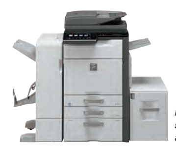
MX-5141N shown with saddle-stitch finisher and optional MX-LC11.

This series offers a choice of four high-performance finishers that can give your documents a professional look and feel. Choose from a compact inner finisher , a floor-standing 1K saddle-stitch finisher , a 4K saddle-stitch finisher or a 4K stacking finisher. All finishers offer three-position stapling and an available 3-hole punch.