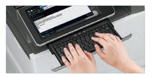
Full-size retractable keyboard simplifies data entry.*