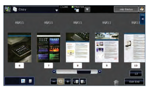
Easily edit documents in scan preview mode.