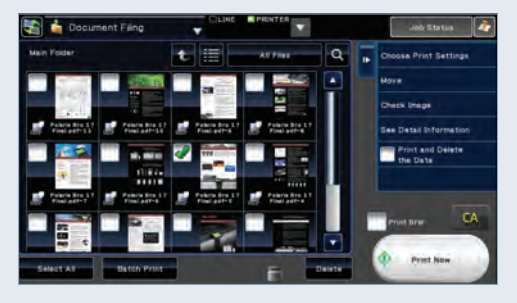
Sharp's Document Filing System with thumbnail preview makes it easy to locate and retrieve stored jobs.